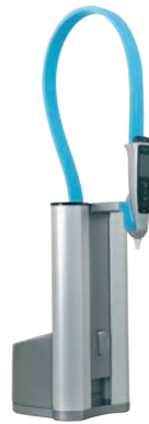
PURELAB flex 1